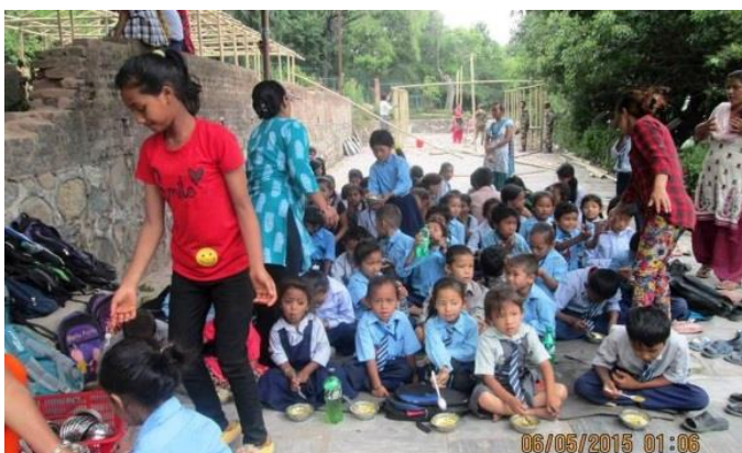
Above: Oms' Home children with treats Left: Jana Sudhar School breakfast club (in background, temporary classrooms being built)

By the end of June 2015, we were becoming aware of some major repairs or rebuilding required to the homes of some families.