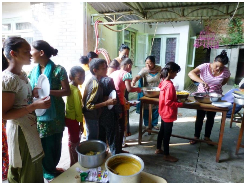
OPEN DAY, OCTOBER 2014, AT SAVE LIVES FOUNDATION ORPHANAGE.

All sponsored children and their families are invited – and they all eat a huge amount of food!