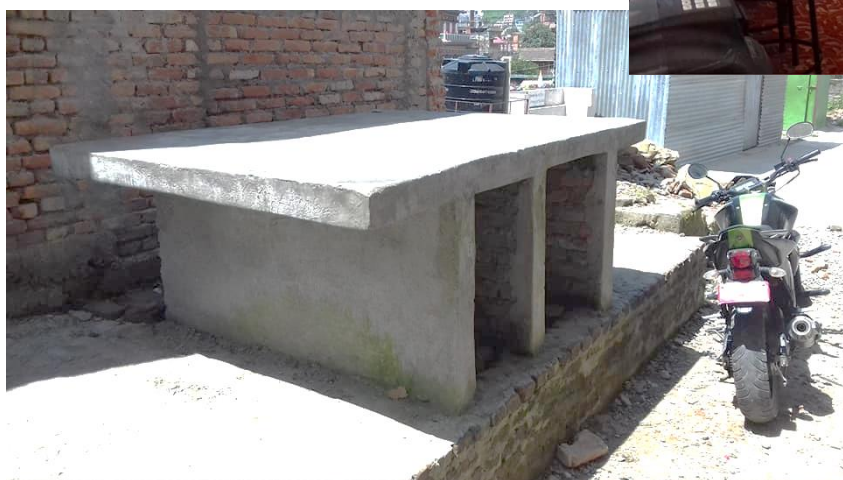
Outdoor table tennis table at Jana Sudhar School, funded by KIKN – it's pretty sturdy!!