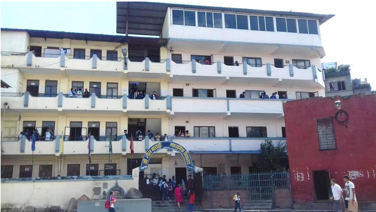
Neel Barahi School building.

We fund a breakfast club for 100 children every school day at Neel Barahi school.