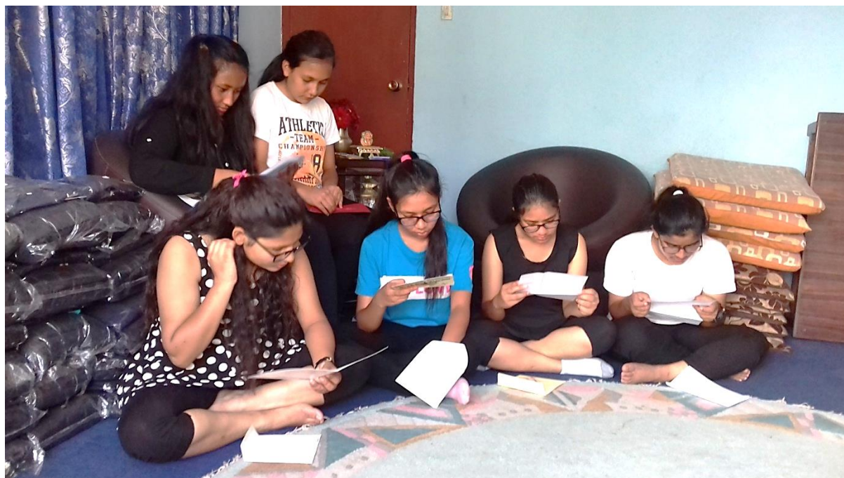
6 th form students from Paropakar Orphanage reading letters from their sponsors

The table below demonstrates KIKN's position in the next 7 years