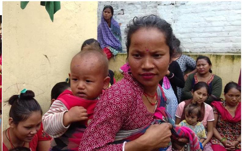
Ishwor School families collecting food donated by KIKN, for the Dashain Festival in early October.

KIKN funds a breakfast club for 80 children every school day at Ishwor School