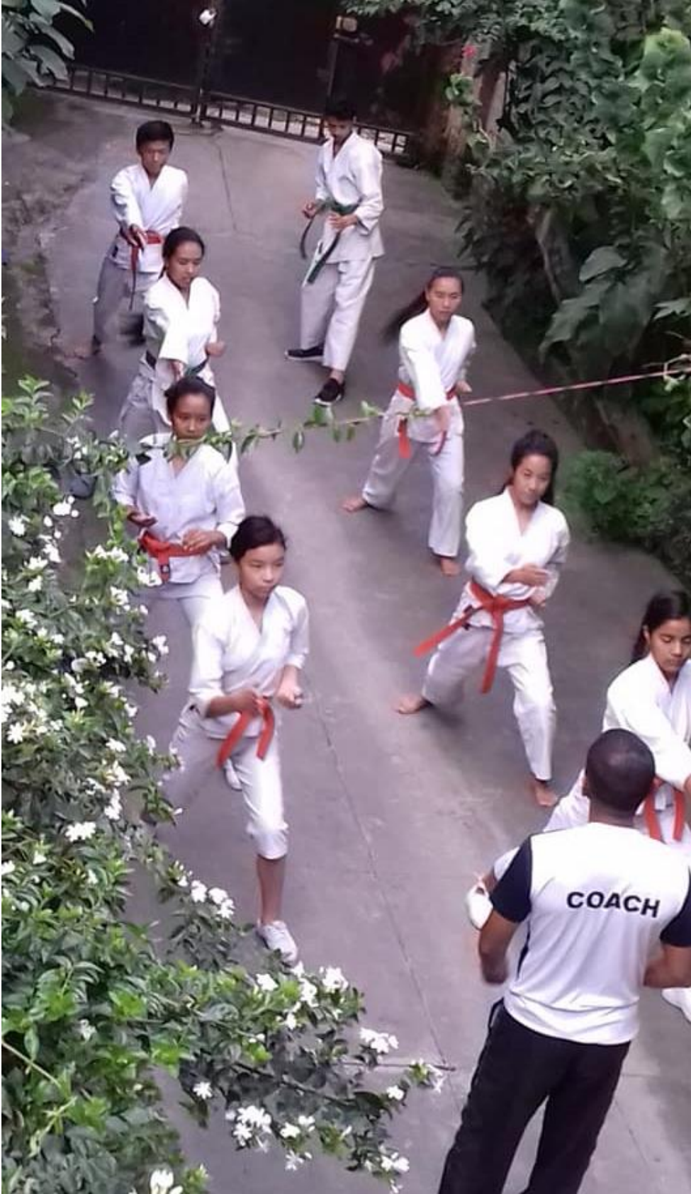
Save Lives Foundation Orphanage – karate classes funded by KIKN.