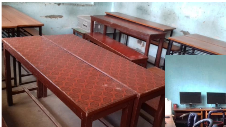
Classroom furniture and computers funded by KIKN at Jana Sudhar School.