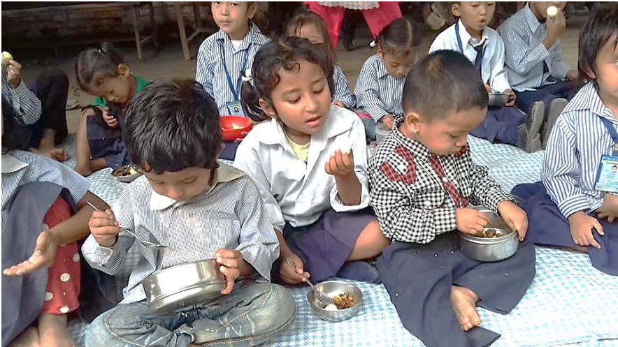
Lubhoo Breakfast Club – 100 children receive food every school day, funded by KIKN