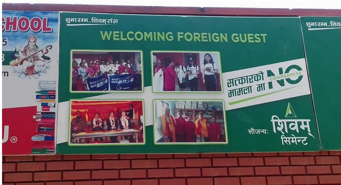
Large welcome boards at entrance to Jana Sudhar school, where KIKN features in the bottom right corner of photograph. This school is supported by several other charities, as well as KIKN.