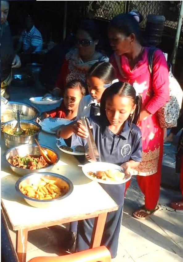
Food being collected by children and parents attending Open Day.