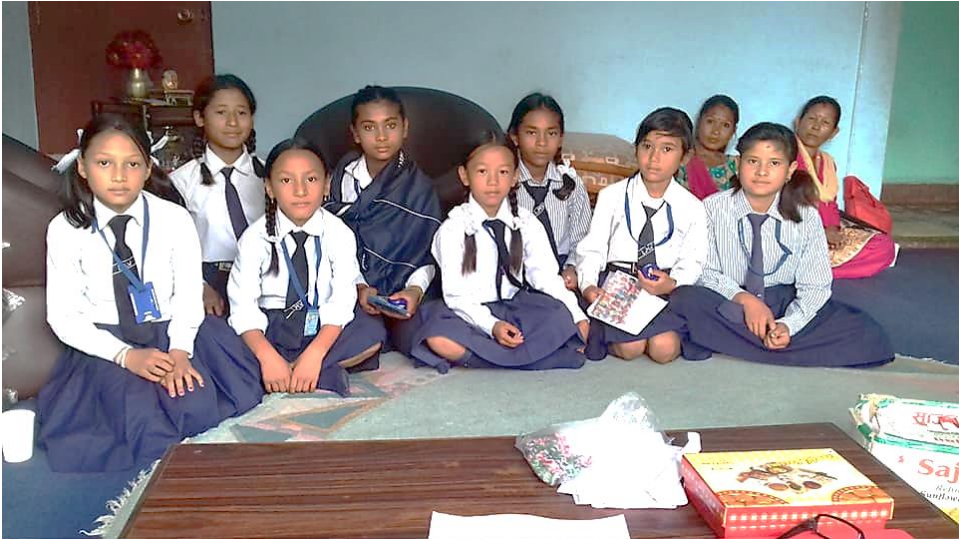
Eight of KIKN's 9 sponsored girls from Lubhoo School